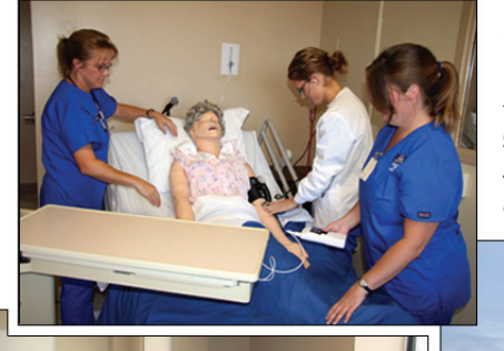
DMACC nursing students 'assess' a patient in the Iowa Building. The simulator generates several bodily signals necessary for patient evaluation.

For DMACC and many nurses of the future, the refurbished space is a very welcome 'addition.'