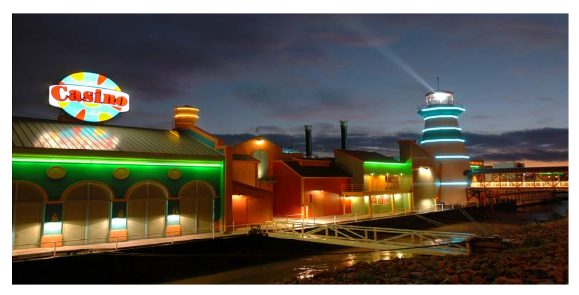
Sioux City, IA