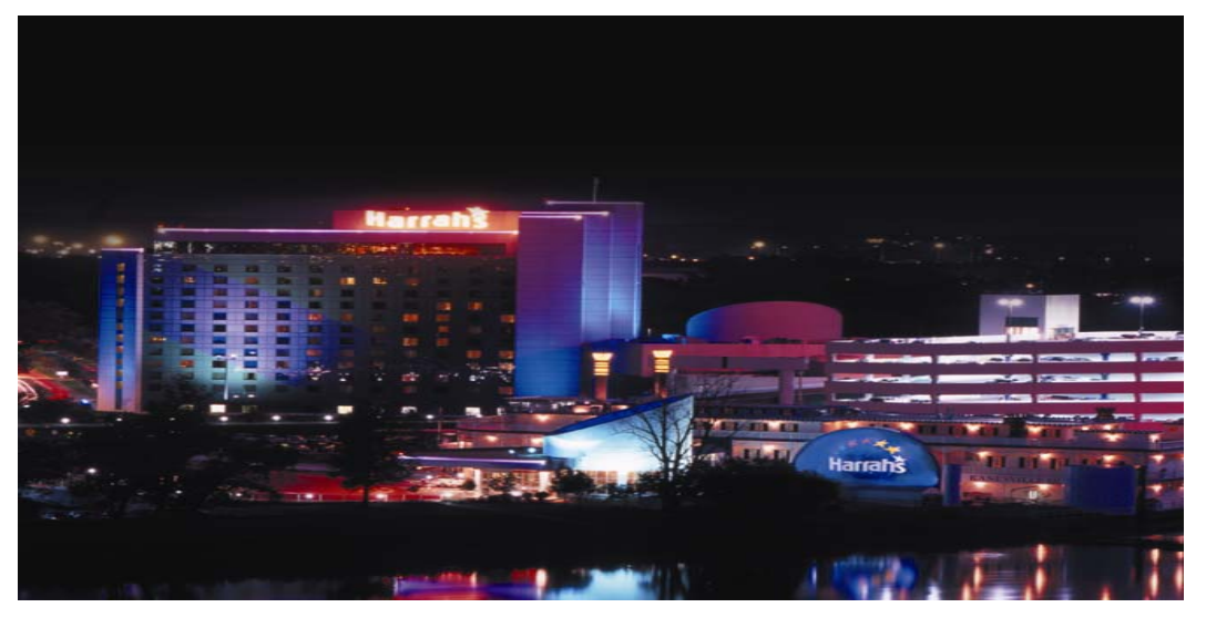
Council Bluffs, IA