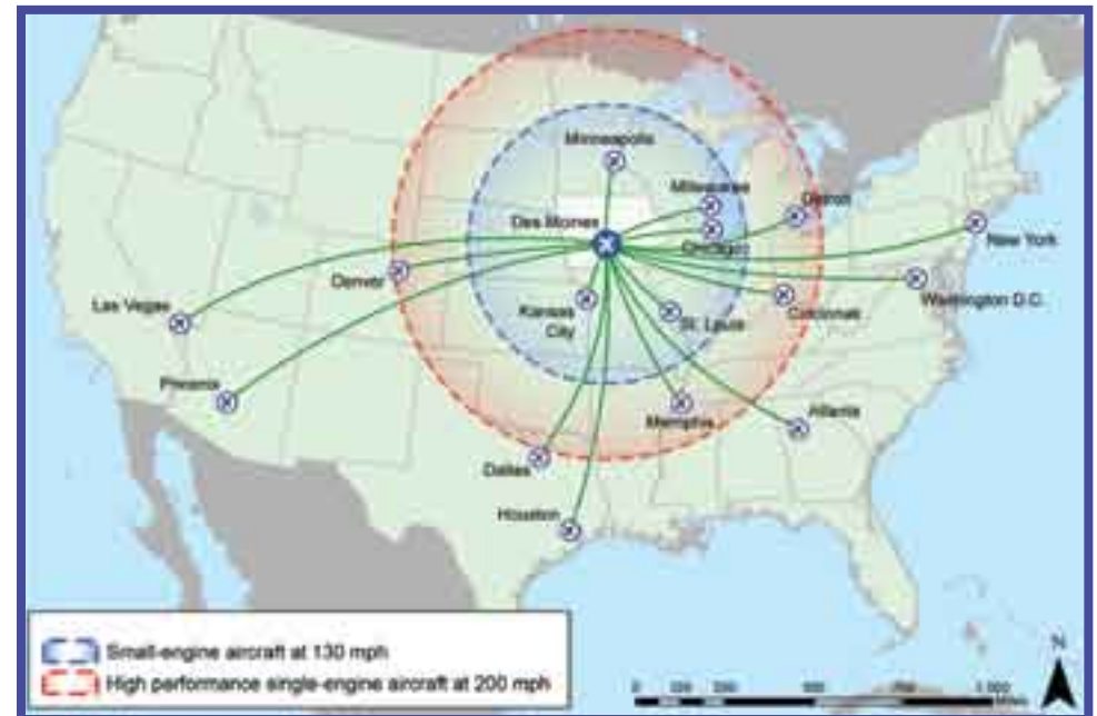
Three-Hour Flight Time for Single-Engine Aircraft

Airports provide access to the air transportation system and are gateways to the communities and regions they serve. Some airports are more highly developed than others and serve different types of demand. Some of the more common activities and services at airports in Iowa are listed to the left. The map below demonstrates how even single-engine general aviation planes help to support efficient business travel.