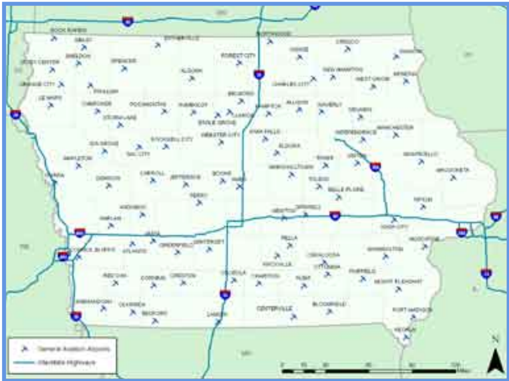
General Aviation Airports Reporting Aerial Applicator Activity