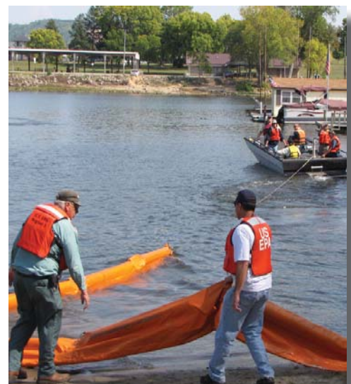
Participants in the Spill Response Workshop deploy a boom onto the Black River.