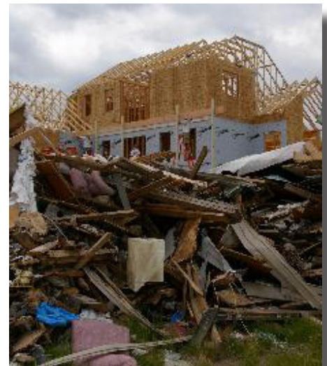
The photo above from Parkersburg shows the recovery process in action as a home is rebuilt adjacent to debris that still covers the ground.