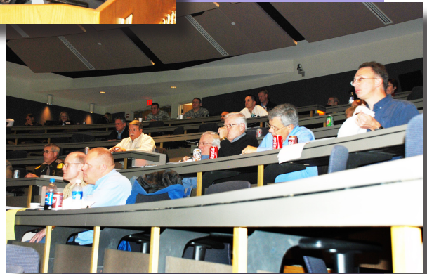
Bottom three photos: Participants at the Tri-State Train Derailment Workshop held in La Crosse, Wisc., Dec. 3-4 learn about prevention, protection, response and recovery in the event of a train derailment incident.