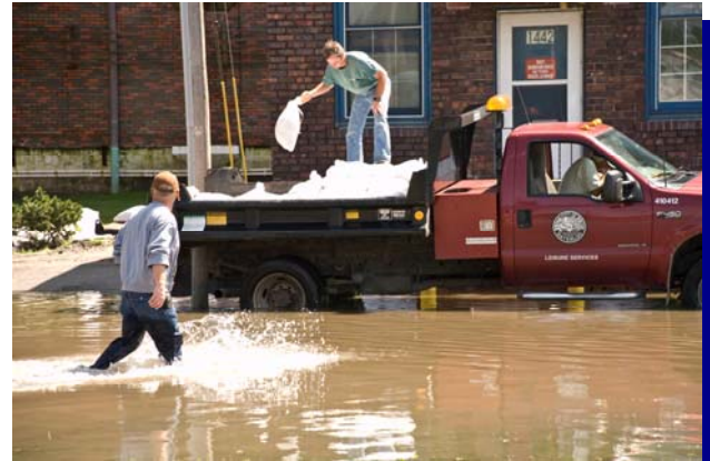
Waterloo residents distribute sandbags in June.