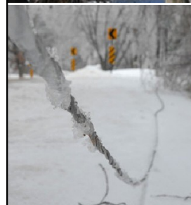
Above, an Alliant Energy employee works to restore power near Centerville following the December 10th ice storm. At left, ice brings down a power line in Cedar Rapids...one of many downed power lines following the storm.