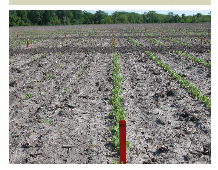
Figure 3. Early planted soybeans should be scouted frequently for bean leaf beetles. Bean leaf beetles were not managed in the plot to the left.

Crusting Damping off Late spring frost Bean leaf beetles Sudden death syndrome