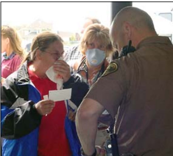
SNS actor - A volunteer actor pretends to show symptoms at the mass dispensing site during the SNS exercise.

Funding for the exercise was provided by the U.S. Office of Domestic Preparedness with $25,000 coming from state bioterrorism funds.