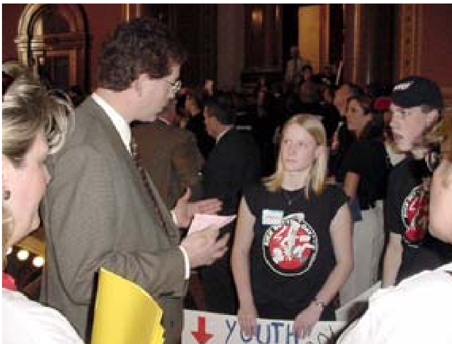
Youth ask for assistance - High school students speak to Senator Bob Brunkhorst from Waverly during Kick Butts Day last month.

The youth asked Iowa's leaders to fully fund a comprehensive tobacco program and reduce youth tobacco consumption by increasing Iowa's tobacco tax. The event was part of a nationwide movement, Kick Butts Day , sponsored by Tobacco Free Iowa and the Campaign for Tobacco-Free Kids.