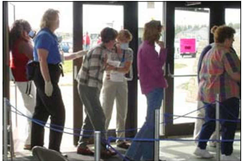
Mass dispensing site in action - Volunteer actors enter the mass dispensing site to receive treatment and/or antibiotics during an SNS exercise last month.

Nearly 400 people were processed through the dispensing site in three hours, exceeding expectations. The original goal was 300. In a real event, more dispensing sites would be operating and the public would be informed of their loca-