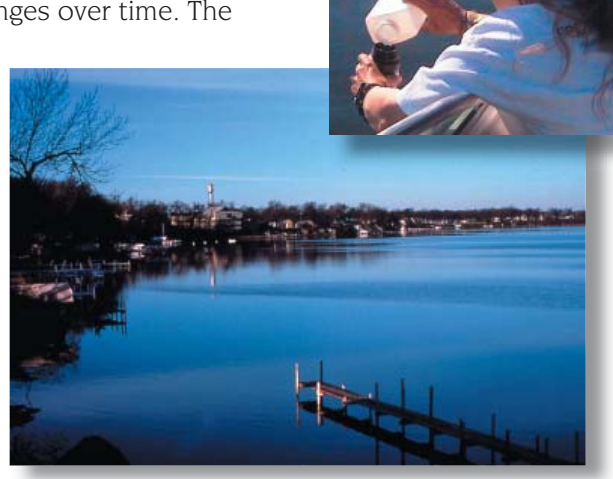
West Okoboji Lake, shown here with Arnold's Park in the background, is the deepest of Iowa's glacial lakes.

To become a CLAMP volunteer, contact Jane Shuttleworth at (712) 337-3669 (ext 7). Fact sheets summarizing CLAMP data are available at wqm.igsb.uiowa.edu/publications/fact%20sheets/default.htm