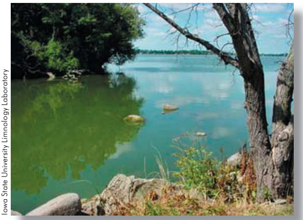
Silver Lake in Dickinson County.

larger lakes, CLAMP data also illustrate the differences within these lakes. For example, volunteers have found