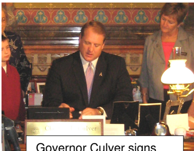
Governor Culver signs into law Senate File 101.

For more information on Child Abuse Prevention Month, please visit our website at http://www.pcaiowa.org/public_awareness.html .