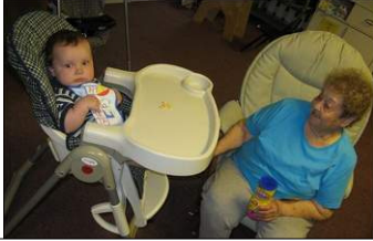
Emergency child care site in Cedar Rapids

To view the Cedar Rapids Gazette article, Emergency care centers open for flood displaced kids, visit: http://gazetteonline.com/apps/pbcs.dll/article?AID=2008874348861