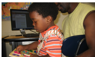
A father utilizing the parent resource room at Carver takes time out to work a puzzle with this son.