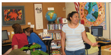
A family advocate at Carver talks with the IEB about the services that program provides.