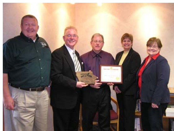
95% Safety Belt Usage Award was presented to MUSCATINE COMMUNITY COLLEGE, Muscatine, Iowa on February 23, 2009.