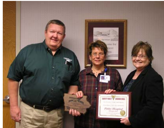
95% Safety Belt Usage Award was presented to FINLEY HOSPITAL, Dubuque, Iowa on February 19, 2009.

To obtain an application and more information regarding this program go to the GTSB web site at http://www.dps.state.ia.us/commis/gtsb/forms/HonorRollBooklet.pdf or contact the GTSB by phone at 515-725-6123.