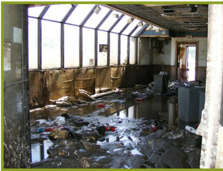
A restaurant is devastated by the Cedar Rapids flood.

Spring and early summer in Iowa this year have been characterized by relentless severe weather. In addition to two deadly tornadoes that struck Butler and Monona Counties, flooding during most of June resulted in 86 counties receiving disaster proclamations by Governor Chet Culver . Among them, 70 have received a presidential declaration. Nearly 39,000 people had to be evacuated in 18 counties, and damage estimates are already in the billions of dollars.