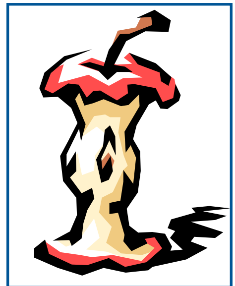
The logo for the state assessment "core team."