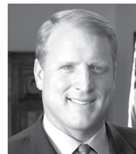
Governor Chester J. Culver

The businesses must reopen within 12 months from the time their Jumpstart applications are approved. To qualify, business owners must have received a disaster loan from the Small Business Administration or a federal- or state-chartered financial institution.