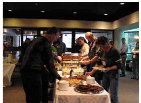
Workshop attendees enjoyed the buffet

Registered Workshop people who were unable to make it on the 24th will receive the information packet with all the handouts. All registered workshop people will receive a transcript of the morning session when it is available.