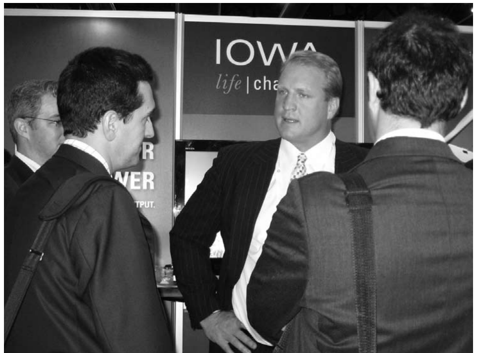
Governor Chet Culver (center) greeting business prospects at the Windpower 2008 Conference & Exhibition in Houston.

While leading the Iowa delegation of developers, Governor Chet Culver was presented the 2008 State Leadership Award from the American Wind Energy Association. Governor Culver said, "This is an honor I accept on behalf of all Iowans who believe we can lead the nation in wind energy and become the renewable energy capital of the United States."