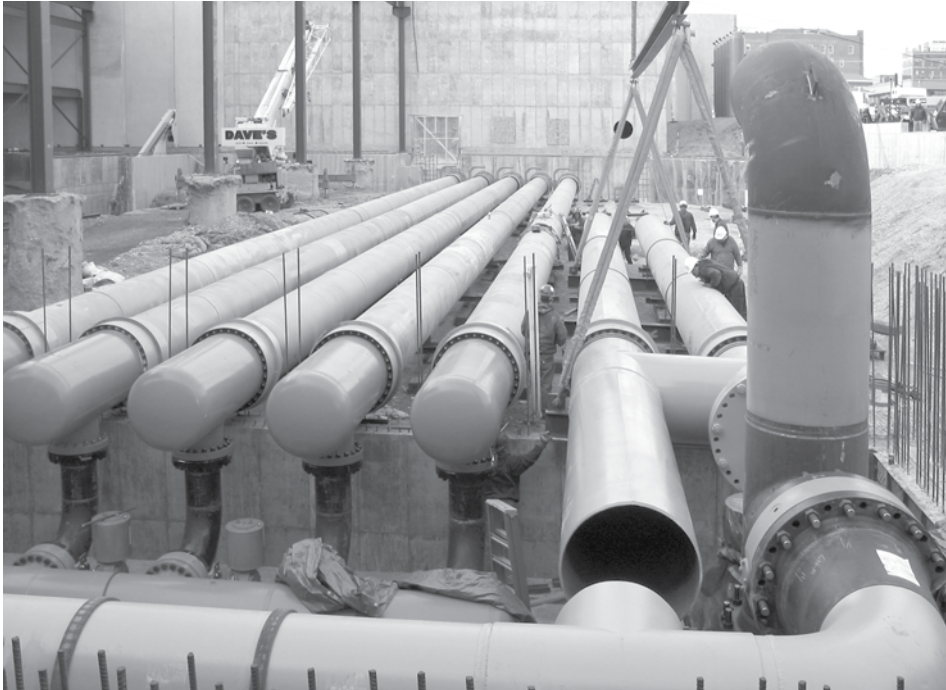
Fisher Technology Development Center

More than 400 loops of pipes are going into Fisher's $19 Development Center, which was awarded Enterprise Zone tax benefits from the Iowa Department of Economic Development. When completed in 2009, Fisher will have the best laboratory in the process control industry.