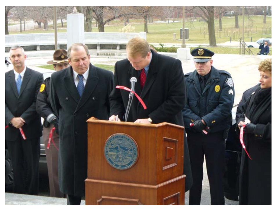
Red Ribbon Signing