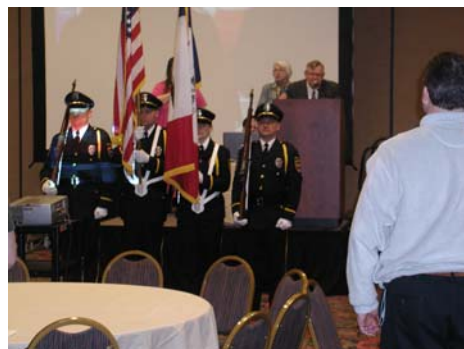
Cedar Rapids Police Department Honor Guard at the 2006 Governor's Traffic Safety Bureau Conference

The 2007 conference is being planned for April 10 – 12, 2007 at the Embassy Suites in Des Moines. Conference updates can be found on the GTSB web site at http://www.iowagtsb.org