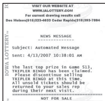
The printed "News Message"

It might be helpful for retailers to review the procedure for retrieving a message from the terminal. As an example, when the last top prize for the Tripler Bingo game (game 513) was claimed in mid-April, a message was dispatched through all terminals. When a message is sent to a lotto terminal, it makes a noise like a ringing telephone. Retailers should then touch the red "News Message" icon in the upper left-hand corner of the