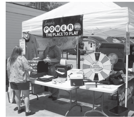
Use the Lottery's tent and wheel to create excitement for your store!

Tent Promotions: The Lottery also has a tent available that can be set up in an area outside in your parking lot or yard where lottery products can be sold and giveaways held. Ask your DSR about booking the tent and the prize wheel!