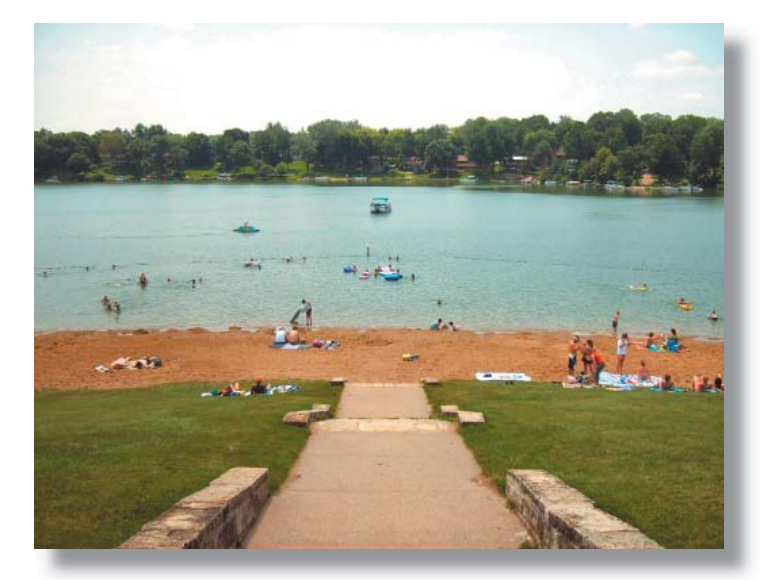
The beach at Lake Macbride State Park in Johnson County is crowded with beachgoers on warm summer days.

If you have gone to the beach or paid attention to the news, you may have heard phrases like "The water is contaminated!" or "Don't go in the water!" Beach monitoring programs, not only in Iowa but across America, try to get out messages about what the real water quality is like. More often than not, however, good news about water quality isn't newsworthy. It is usually after a beach has a high sample result that press releases, newspaper articles, and advisory signs appear, while little notice is paid to the good results for the weeks before and after these intermittent high samples. Because of this challenge, the public often only hears about the bad results at beaches and might be led to conclude that Iowa's beaches are always contaminated and unsafe for swimming.