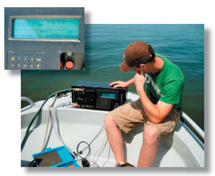
Sampling for optical brighteners at Clear Lake using the Turner Designs 10-AU Field Fluorometer.

at very low levels in water. This process is analogous to holding a recently washed item of clothing under a black light and having the spot where detergent had been poured onto the clothing emit a radiant glow.