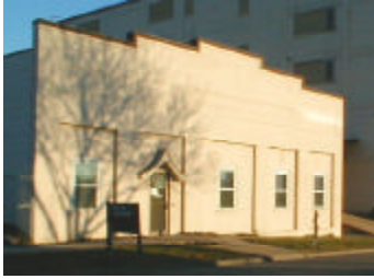
Front entrance to 215 East 7th Street.