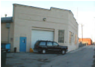
Rear alley entrance.

The Governor's Traffic Safety Bureau has moved. Our new address is 215 East 7th St. The Zip code, phone, fax and e-mail addresses remain the same.