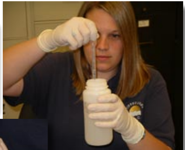
Volunteers used multiple test kits* to determine the levels of E. coli in surface water samples.