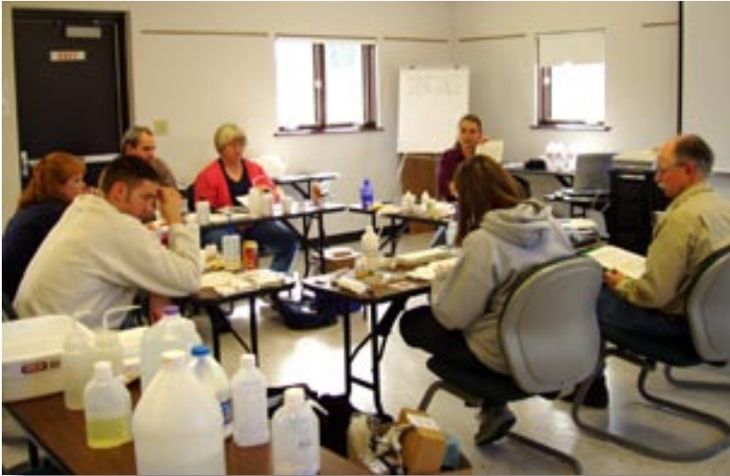
Training sessions will continue to focus on consistent training methods to increase knowledge and proficiency in volunteer monitoring of E.coli bacteria.

placed directly on the agar. The Petri dish containing the media and filter is then covered and incubated at 35 degrees Celsius for 48 hours before being read. Blue/purple colonies are counted as E.coli . In this method, E.coli numbers are represented in colony forming units (CFU) / 100 milliliters of water.