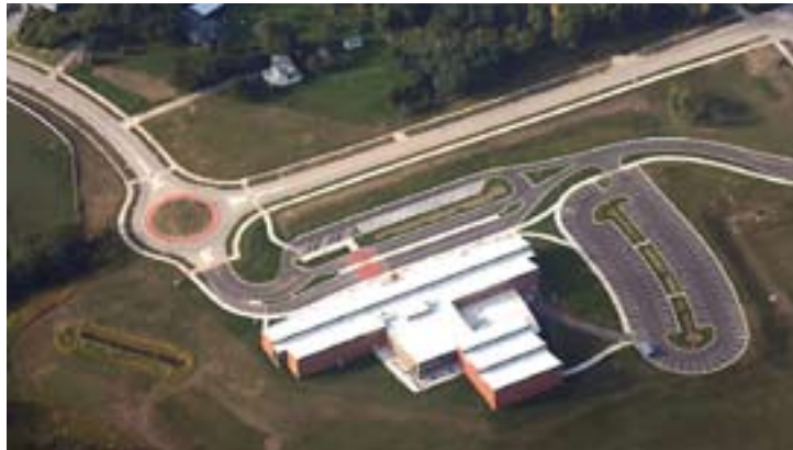
School in North Liberty

Iowa transportation agencies are including modern roundabouts as an additional tool in their intersection toolboxes at many different locations. They are found in urban and suburban settings. Next year, the first rural roundabout is anticipated to be constructed at Black Hawk County Road V-49 (Raymond Road) and Iowa 281 intersection.