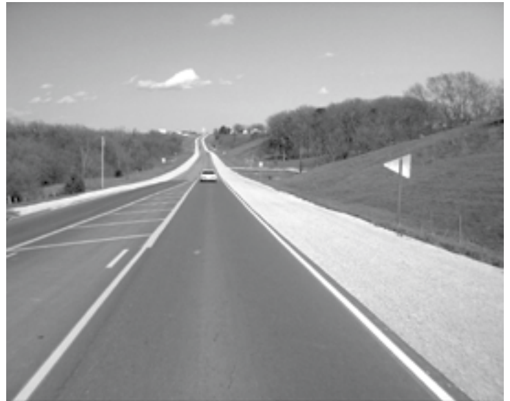
U.S. 34 study site in Osceola after conversion

Traditional safety and/or operational improvements for urban four-lane, undivided corridors include constructing a raised median or adding a fifth (center), two-way, left-turn lane. Both of these alternatives involve widening the roadway, which is costly and sometimes impractical. Converting four lanes to three with a center, left-turn lane may improve traffic operations and safety as effectively as traditional improvements at significantly less cost; however, each site should be evaluated thoroughly for successful application.