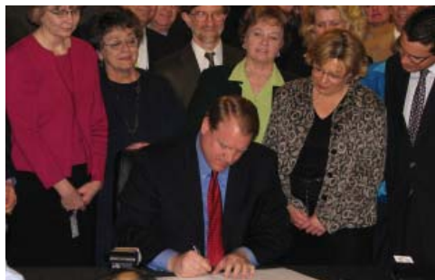
Governor Culver signs bill increasing the state cigarette tax by $1

SF 61 establishes a state policy that school employees, volunteers, and students in Iowa schools shall not engage in harassing or bullying behavior.