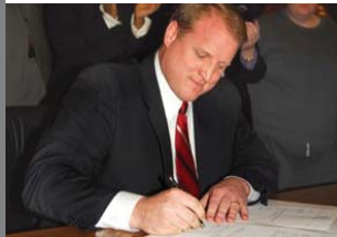
Governor Chet Culver at his first bill signing to increase the minimum wage

On Thursday, January 25, Governor Chet Culver was joined by Lt. Governor Patty Judge, legislators from both parties, and hundreds of Iowans to sign his first bill, HF 1. This bill increased the minimum wage from