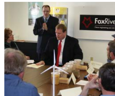
Governor Culver meets with business leaders in Osage to discuss the future of renewable energy in Iowa

On Wednesday, March 14, Governor Culver met with business leaders in Osage, Iowa, a community that is on the cutting edge of renewable energy technology. Meeting at Fox River Mills, a textile company that makes products from corn fiber, the Governor discussed the Iowa Power Fund , a $100 million investment in renewable energy technology that is designed to grow Iowa's community and secure Iowa's energy future.