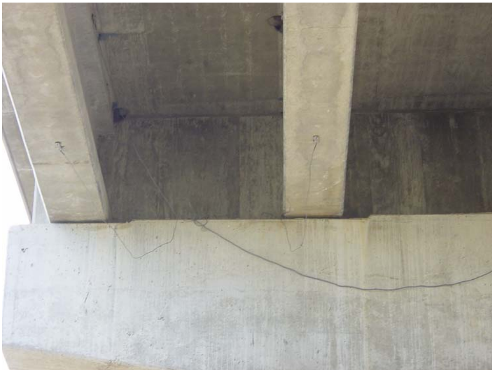
Figure 2. Photograph of instrumentation used to monitor bridge response.