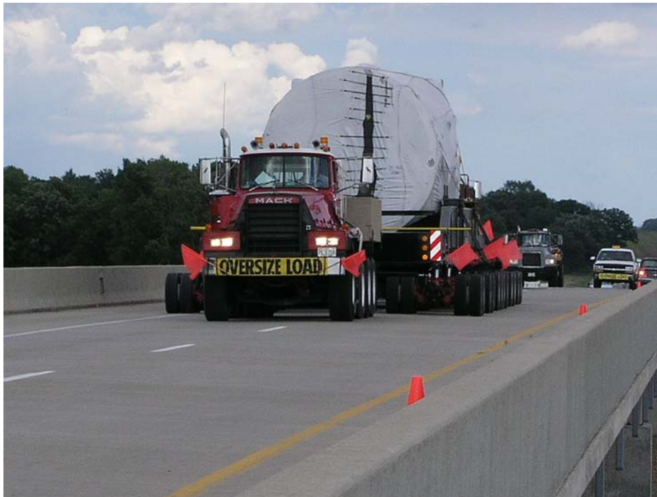
Figure 4. Photograph of superload passage.