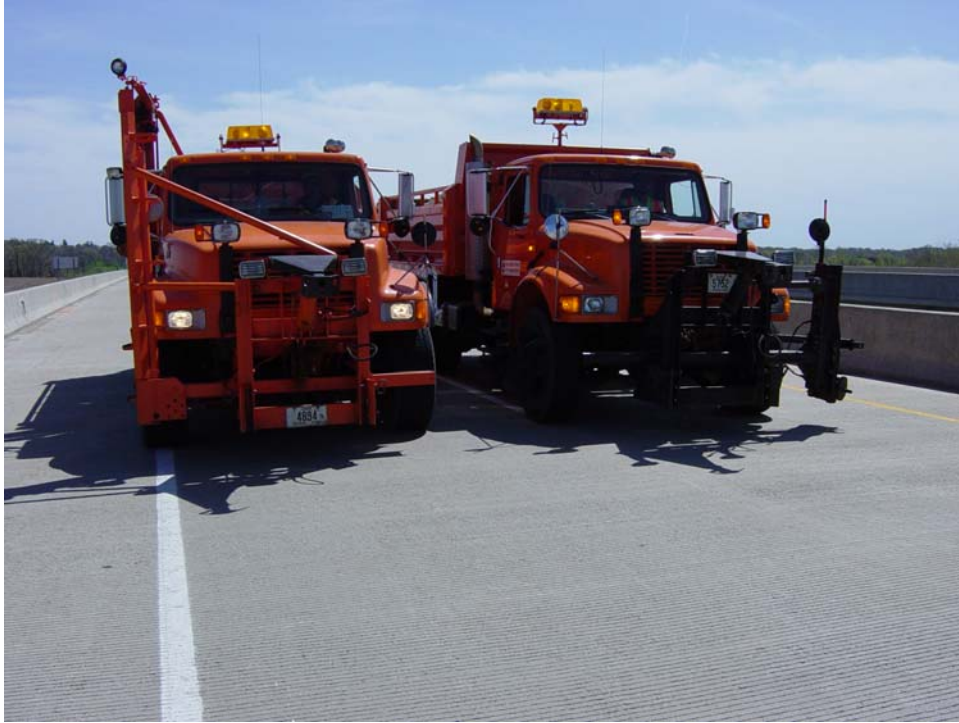
Figure 1. Test trucks used to perform preliminary testing of Bridge.