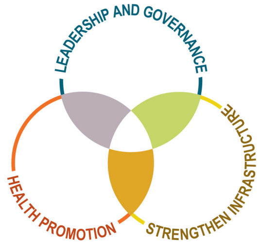
Required Areas of Work (Population Health Activities)

In order to advance population health within every Iowa county, the LPHS contract was redesigned in Fiscal Year 2023 (FY23) to initiate the dedicated use of LPHS funds towards the Public Health System Areas of Work. The required areas of work are leadership and governance; health promotion; and strengthening local public health infrastructure.