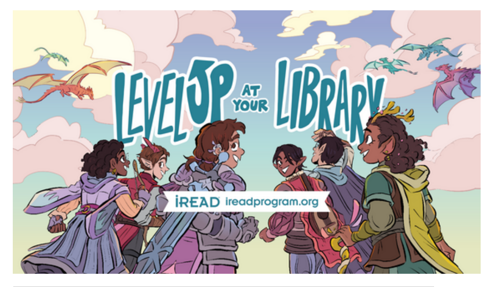
Ready or not, it's time to start thinking about Summer Reading!

This year's theme, Level Up At Your Library! is all about puzzles, games, and play - so take a peek at what we've got planned!