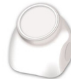
Table Top Dispensers