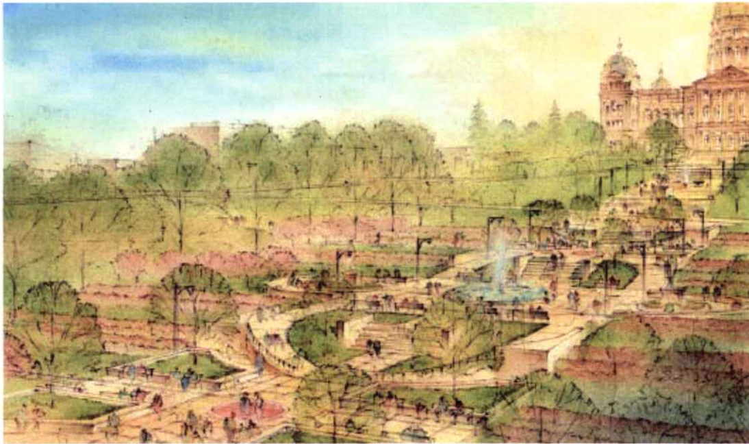
Concept drawing of the West Capitol Terrace, courtesy of Brian Clark + Associates