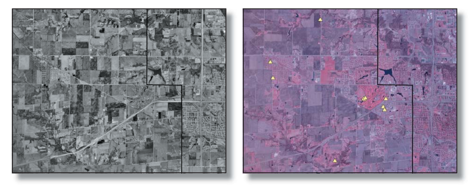
Figure 4 . Comparison of 1992 black and white photography (left) and 2002 color infrared photography (right) of the area shown in Figure 2. Details of building development can be seen. By adding the approximate locations of wells to the CIR (represented by triangles), decision makers can see if proposed projects affect wells used for drinking, industrial, or irrigation purposes.