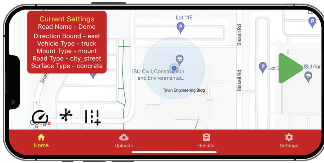
CyRoads smartphone app