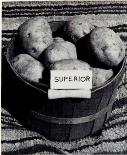
Superior is a medium early white potato of good quality. Superior has resistance to potato scab.