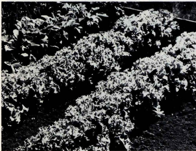
Green Ice lettuce has good texture and flavor and is resistant to heat. Can be used over a longer period than most leaf lettuce varieties.