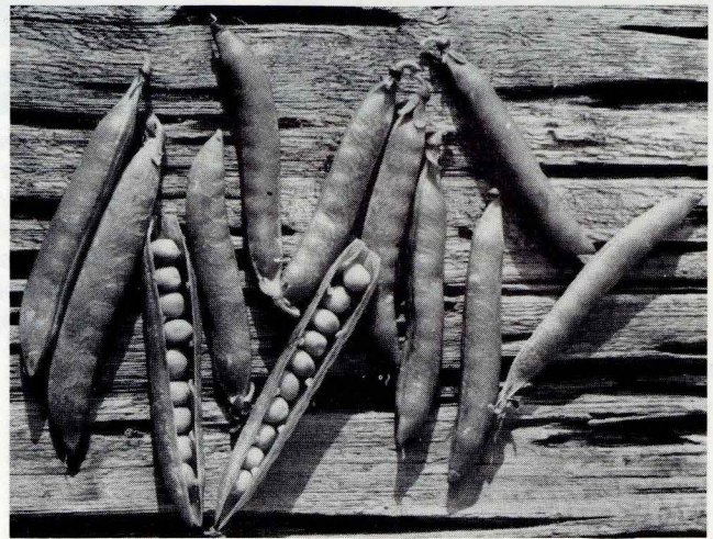
Green Arrow pea is a good yielder of tasty, sweet peas. Some pods yield as many as 13 "seeds" per pod. Green Arrow has resistance to downy mildew and fusarium wilt.