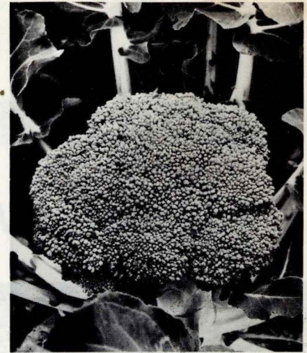
Broccoli Premium Crop is a 1975 All-America selection. This variety produces large heads with tighter, more compact bud clusters. Ready to harvest about 58 days from transplanting.