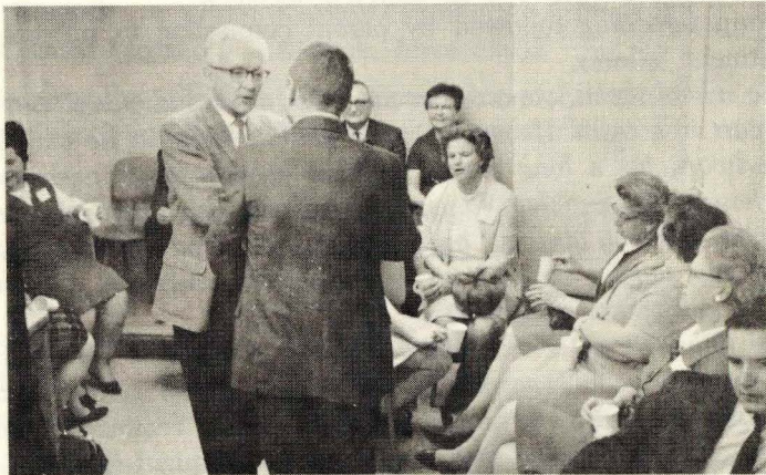
Small group discussion

The school social worker provides services designed to enhance the social functioning of the individual student. Equated with enhanced social functioning is the increased ability of the student to learn, thus accomplishing the goals of the educator to provide basic academic