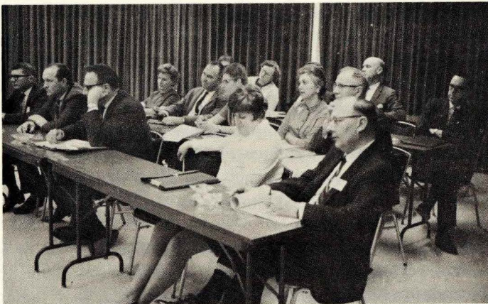
School Social Work visit

School social work should strengthen the bonds between home and school with the worker acting as a liaison between the two. Improved communications can prevent many misunderstandings! The worker has an opportunity to be in the homes and to talk with parents in their