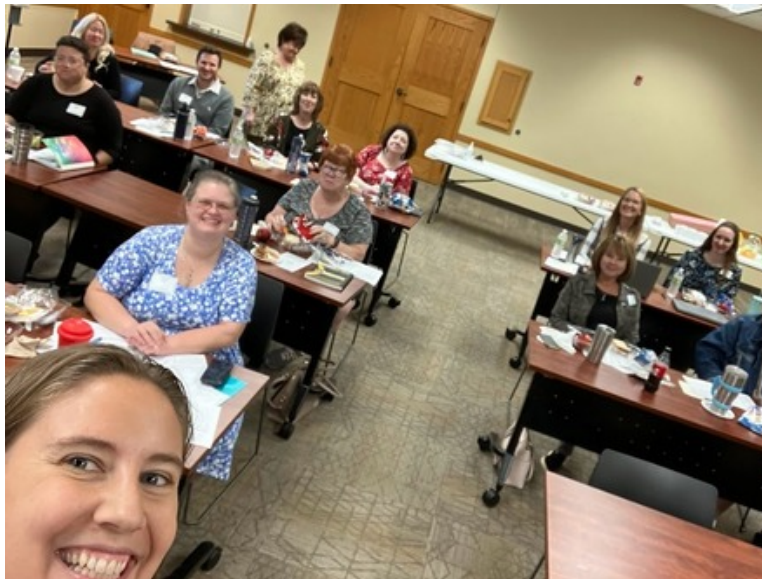
Attending the in-person Learning Circuit on Sept. 28 in Sioux Center.