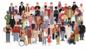
Job and Resource Fair for English Language Learners

Thursday, September 21, 2023 11:00 am - 1:00 pm DMACC Urban Campus, Building 7 1144 7 th Street, Des Moines, IA 50314