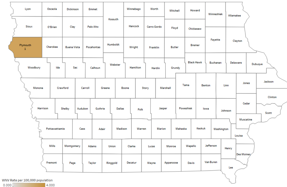
Figure 1. 2023 West Nile virus case count and incidence rate by county of residence.