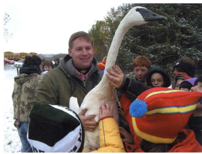
Your license plate money will benefit successful restorations, such as trumpeter swans to lowa's precious wetlands.

You can also buy plate gift certificates at your county treasurer's office.