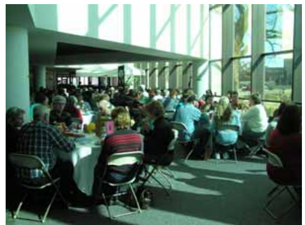
Enjoying lunch at the Workshop

The day was filled with meeting new people, reconnecting with friends, introducing new ideas, sharing experiences and rejuvenating energy and excitement for the upcoming market season.