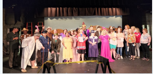
Burlington Area Office students visited the Players Workshop Little Theatre as part of their summer programming.