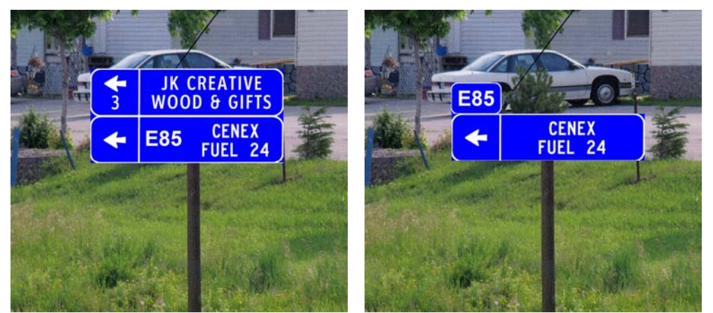
Examples of tourist-oriented destination signs modified to show the availability of E85

Tourist-oriented destination (TOD) signs are available in all rural areas and in communities under 2500 in population. Qualifying gas/service stations that are within five miles of a state highway and are not easily visible are eligible for TOD signs. The Iowa DOT has modified the program to allow an E85 message to be added next to the gas/service station name.