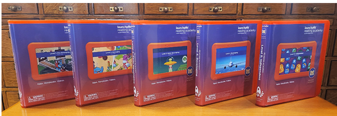
Congratulations to Lenox Public Library, winner of the Reading Academy Playaway Launchpad Set!

Both sets will be making their way to the libraries via IA Shares soon!