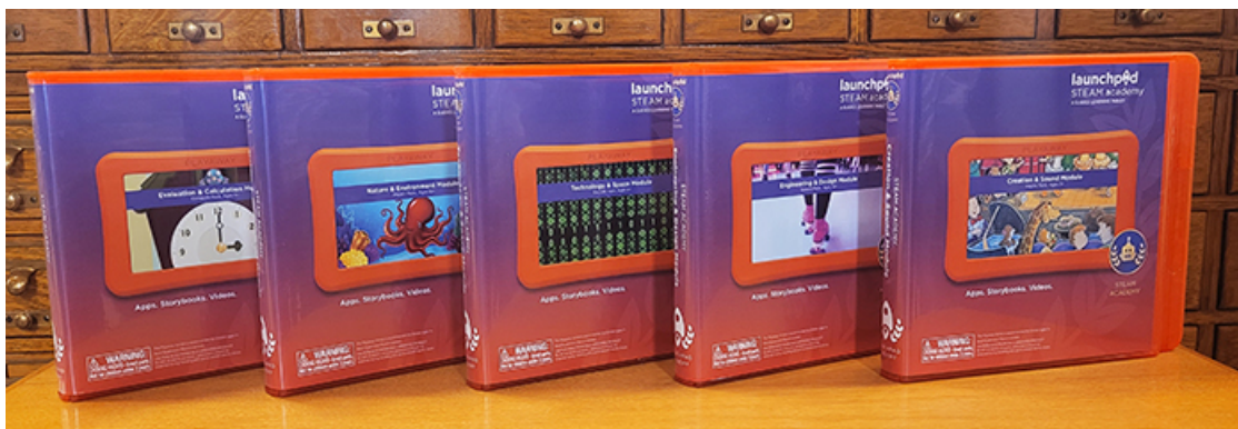
Congratulations to Elma Public Library, winner of the STEAM Academy Playaway Launchpad set!

Participants who attended either of these events were put into a drawing for a STEAM Academy Playaway Launchpad set (STEM Fair attendees) and a Reading Academy Playaway Launchpad set (Summer Reading Summit attendees) for their library.