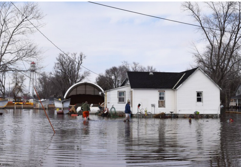
Flooding in Hornick, Iowa, in 2019.