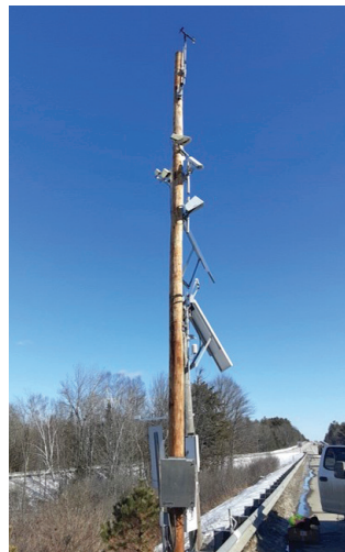
Stationary friction sensors mounted at an RWIS site in Etna, Maine