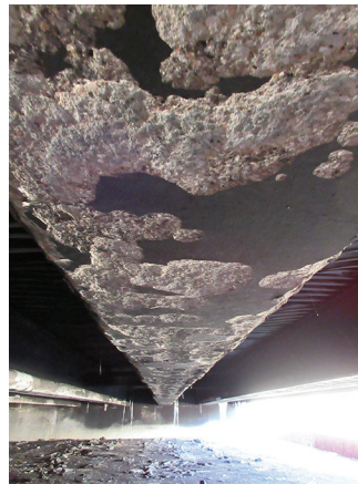
Spalling on concrete girder

The Iowa DOT arranged for the removal of the three selected prestressed concrete girders from the I-29 Sioux City fire-damaged bridge. The girders were brought to a test site at the Iowa DOT maintenance yard in Ames to begin visual and nondestructive evaluation (NDE) condition assessment.