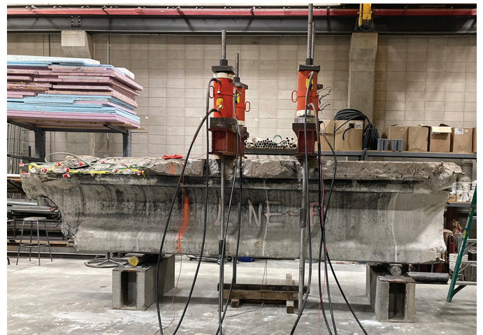
Girder end shear test configuration in the laboratory

The end section of the girder was placed on two roller supports 10 ft apart on top of two reaction blocks.