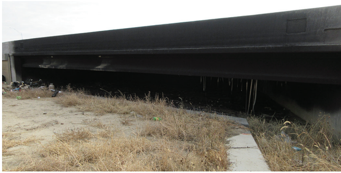
I-29 burned bridge girders over homeless encampment in Sioux City, Iowa

Despite this unfortunate incident, it provided an opportunity to learn more about the residual condition and strength of the bridge girders through this research study. The Iowa Department of Transportation (DOT) elected for the removal and replacement of the bridge, which allowed for three girders to be removed to undergo testing.