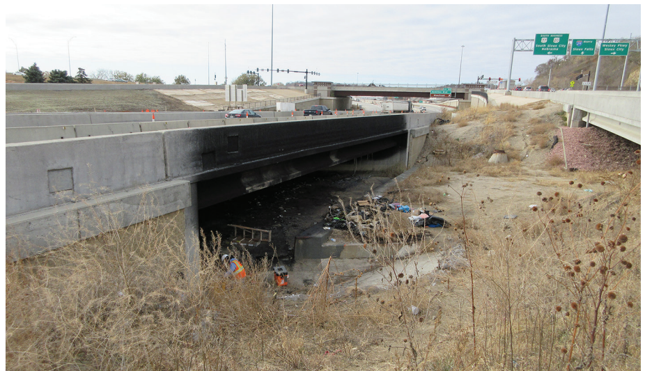
I-29 Bridge fire north side of bridge looking toward west abutment

On October 30, 2019, multiple items within a homeless encampment were set on fire beneath the I-29 northbound bridge over the Perry Creek conduit in Sioux City, Iowa. The fire was exacerbated when a propane tank became engulfed by the flames. The bridge girders and deck were particularly vulnerable to the ground fire because of the minimal ground clearance (about 6 ft) in comparison to that of most other bridges.