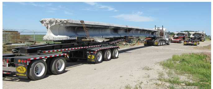
Girder transport to maintenance yard in Ames for testing