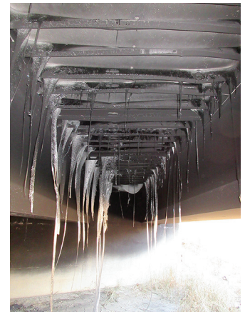
Melted polycarbonate stay-in-place forms