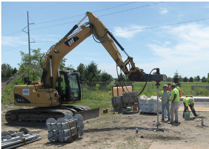
Installation of helical piles in the maintenance yard for testing

Once the piles had been placed, four Dyckerhoff & Widmann AG (DYWIDAG) threaded bars were connected to each of the piles. Reaction beams were placed over the DYWIDAG bars 4 ft on either side of the girder cross-section midspan, leaving 8 ft between the two bars on either side of the girder. Each reaction beam across the girder had a hollow core hydraulic cylinder ram at each end.