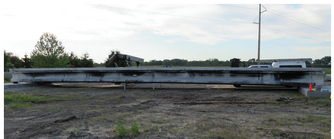
Girder placement in Iowa DOT maintenance yard in Ames