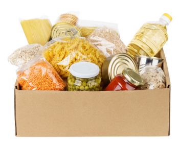
Page 3 Tips for stocking a healthy pantry