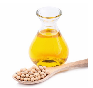
Page 3 Look for health fats