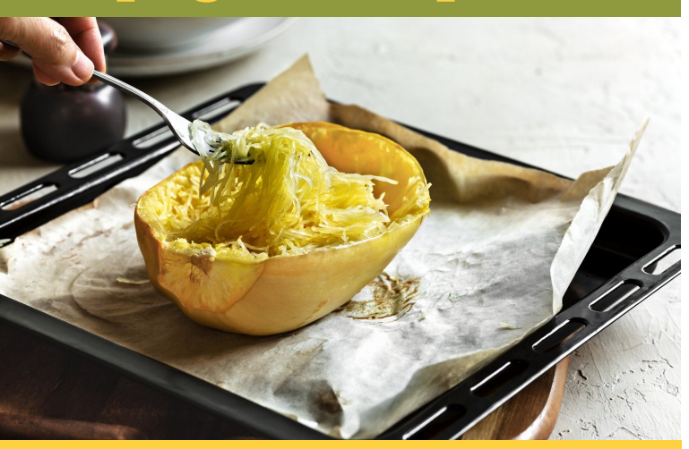
Serves 2-8, 1 squash, $0.75-$1.50 per pound