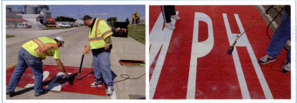
Installation of colored entrance treatment

Pneumatic road tubes were used to collect speed and volume data before and after installation of the rural traffic-calming treatments. Pneumatic road tubes are fairly accurate (99 percent accuracy for individual vehicle speeds), can collect individual vehicle data (speed, volume, headway, and classification), and are fairly low-cost. Data were collected using JAMAR FLEX