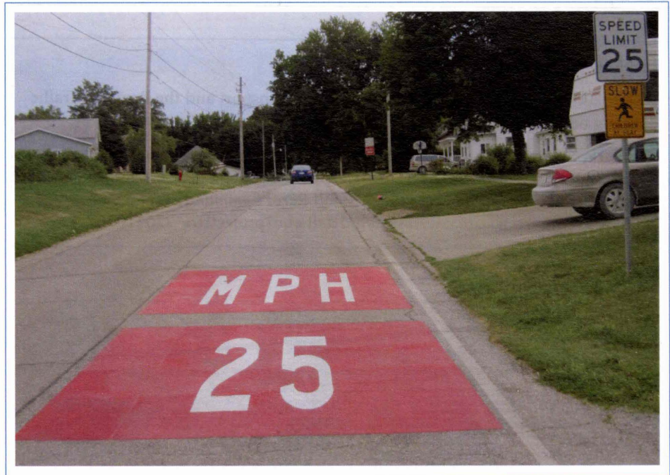
Colored entrance treatment for north community entrance in Ossian

HS counters. Road tubes were typically laid just downstream of the treatment or at the treatment.