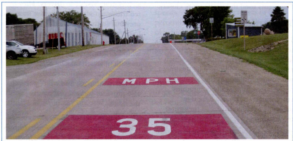
Colored entrance treatment for Jesup east community entrance

Colored surface dressing or textured surfaces are common traffic-calming treatments in the United Kingdom (UK) and are used often in conjunction with gateways or other traffic-calming measures to emphasize the presence